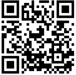
Class Parent Volunteer Form