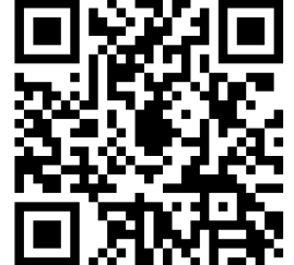
Lunch & Recess Duty Form