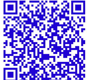
Volunteer Application - Print, hand write & send to office