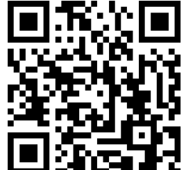
EVENT Volunteer Form