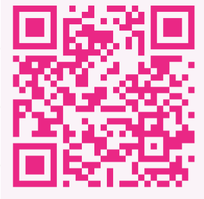
HSA FUNDRAISING OBLIGATION FORM